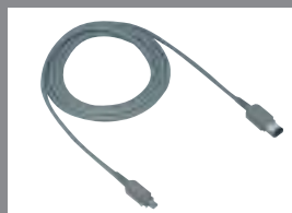
VMC-IL4615/4635 i.LINK Cable (4-pin to 6-pin)